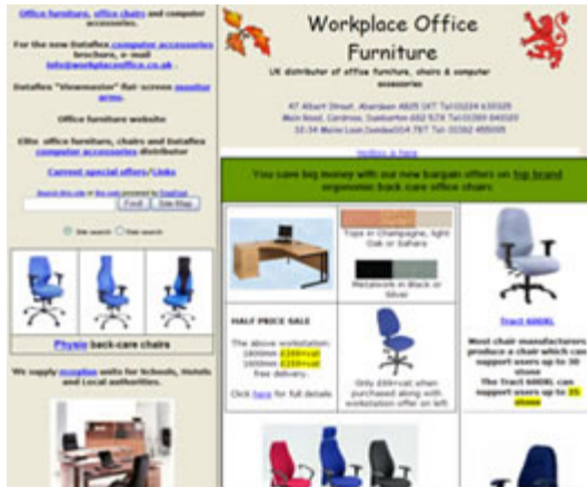
Workplace Office UK's Website